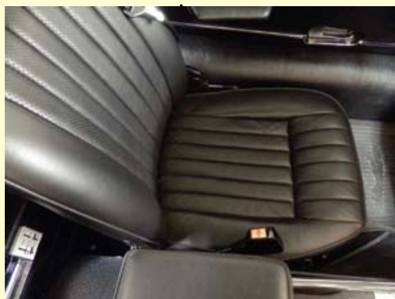
Above: AVV 1 interior after seats recovered with new leather.

hub "Churchill Tools" Hub Puller No.JD.7A), the means of properly filling the hubs, via the removable anti dust cap was reassessed, as this is not a failsafe system, relying on grease being pushed into a void through a 18mm diameter hole in the hub casting. This, no doubt, accounted for the bearing failure, as there was no way of assessing that the hub was properly filled with grease, at the time of rear hub assembly in 1972 at Jaguar Cars. The Jaguar grease packing system for the hubs, being clearly inadequate to ensure that filling was complete, a new system was devised, with a grease nipple added