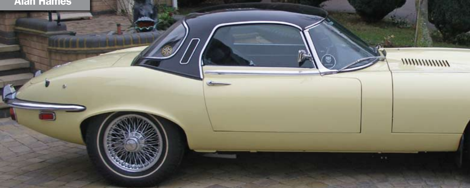
Above: My V12 prepared and ready to go on my driveway.

M y first four years with AVV 1 was a most enjoyable period. Over this time I was using my car as daily transport to my various civil engineering projects and although it was not the car expected to be seen on a construction site, it was nothing exceptional on the road, as Jaguar's E Type production and the sales of the final 50 went on until 1975. However, having always been a car enthusiast I was, throughout this time, carrying out all my own maintenance and the essential cleaning, arising from the difficulties of site dust and dirt as Resident Engineer on major projects associated with the expanding of Northampton and the doubling in size of the town. During this time and the 1974 petrol crisis, being an "essential car user" I was pleased to be provided with a book of petrol coupons, as at 9 mpg in town I did need the extra fuel!