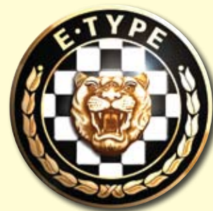
Opposite: AVV 1 Magazine Photograph.

The ensuing bodywork respray however, required a careful match of the Jaguar "Pale Primrose" cellulose be achieved and after various trial mixes, the mix formula was achieved and was copied to me for future reference. Also, an extra two litres of the paint was provided for any later mishaps, which