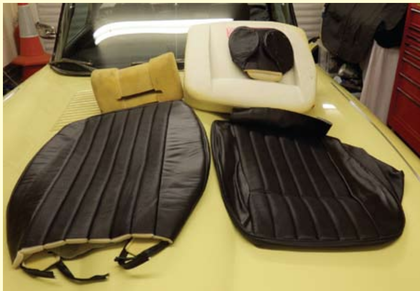
Above: Kit of new leather seat covers and foams prior to fitting.

Within the car the leather seat covers had deteriorated and required serious attention. The seat squabs, which are pleated and stitched, had split, with failure of the stitching thread. Also, the shaped foams beneath the squabs, which are adhesively fixed to the surface leather, were showing signs of shredding. This meant that some serious attention was needed to rectify the problem. The only way forward appeared to be replacement new leather throughout, together with the associated shaped foams. These, as a complete trim set, exactly as original, were obtained from the American trim company G.W.Bartlett. Fitting then being necessary and not being a trim expert, I was at something of a loss where to go, especially as Bartlett's in the UK were a supplier only, with no fitting facilities. However, AVV 1, being already so well known, the company's UK Manager, after obtaining the agreement of Gary Bartlett in Indiana, confirmed that he would arrange all the fitting for me in-