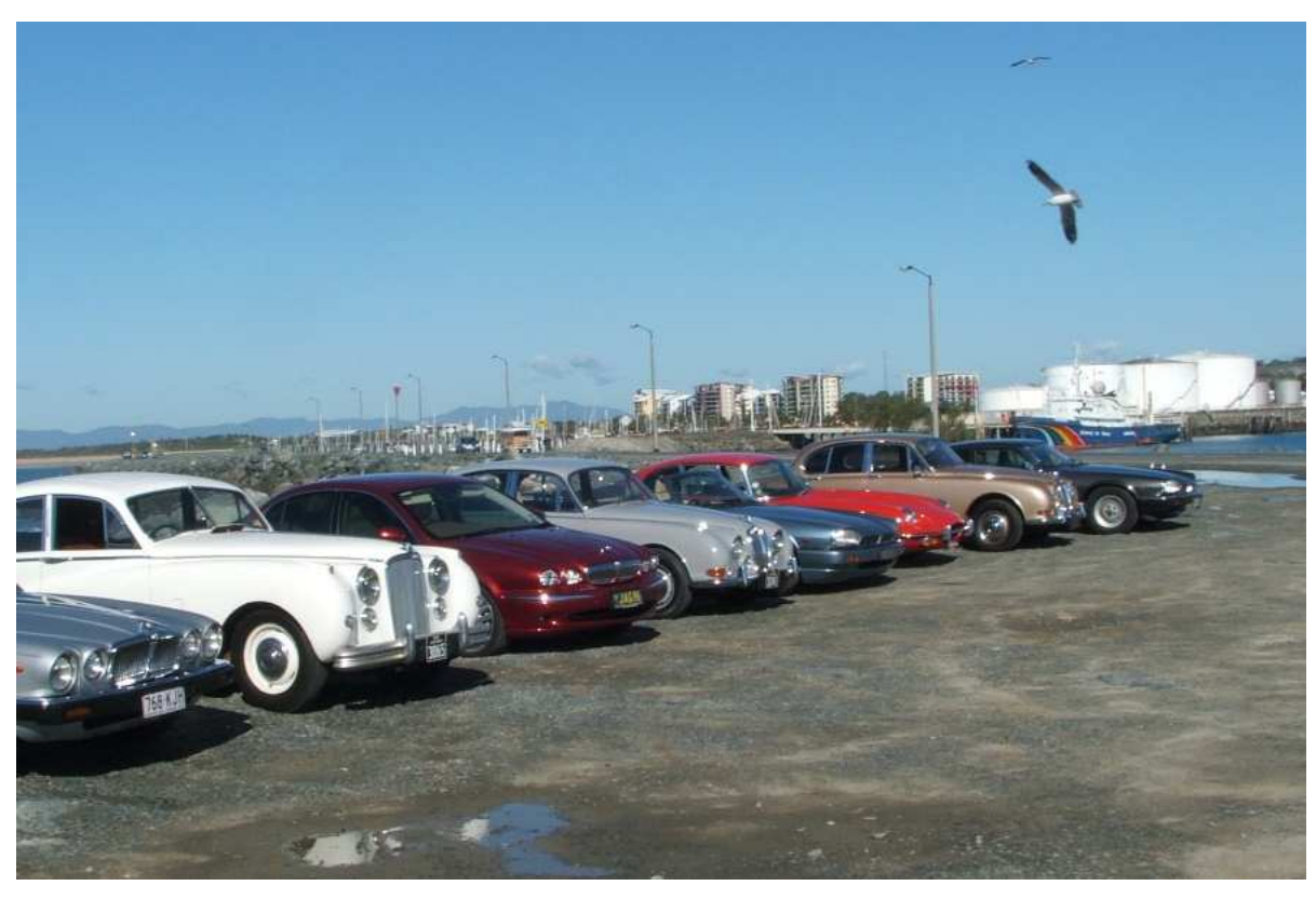
MACKAY WEEKEND AUGUST 2008