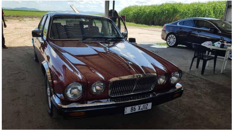
Most of us can only dream of getting a shine like this on our cars!!