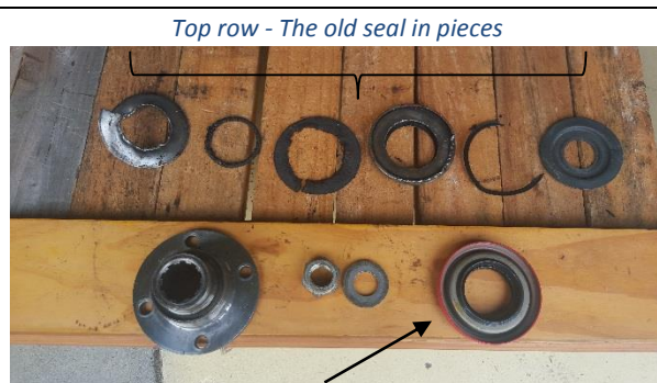
Top row - The old seal in pieces

I have mentioned before that the diff pinion oil seal was leaking badly – not surprising really as they were originally a leather seal with a paper gasket, and mine had never been changed. The replacement seal was a similar size to the old one, but a very different design, so I had little idea of the shape of the seal to be removed. I had to destroy the seal to remove it, and when I did, after much hammering/chiselling/cursing I had several pieces on the floor – but the new seal would never fit! Part of the old seal was still there. After much internal debate I continued to destroy/remove bits of metal until I found the oil thrower, so the new seal would finally fit – but the drive shaft yolk was now a very tight fit onto the shaft, and required a helping light tap with a soft hammer. When everything was tightened up as much as I felt comfortable with, there was so much backlash that I KNEW I had managed to destroy the mysterious inner workings of the diff. There followed several nights of despair and sleeplessness. Where to get another diff?