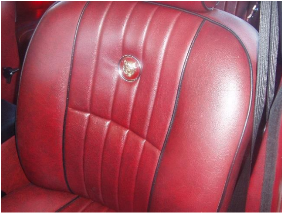
The 1986 XJ12 S3 Sovereign has a JAG emblem in the front seat squabs