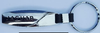
Keyring - $5