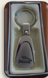
Key Ring $6