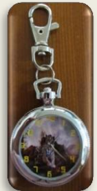
Key Ring/Watch $15