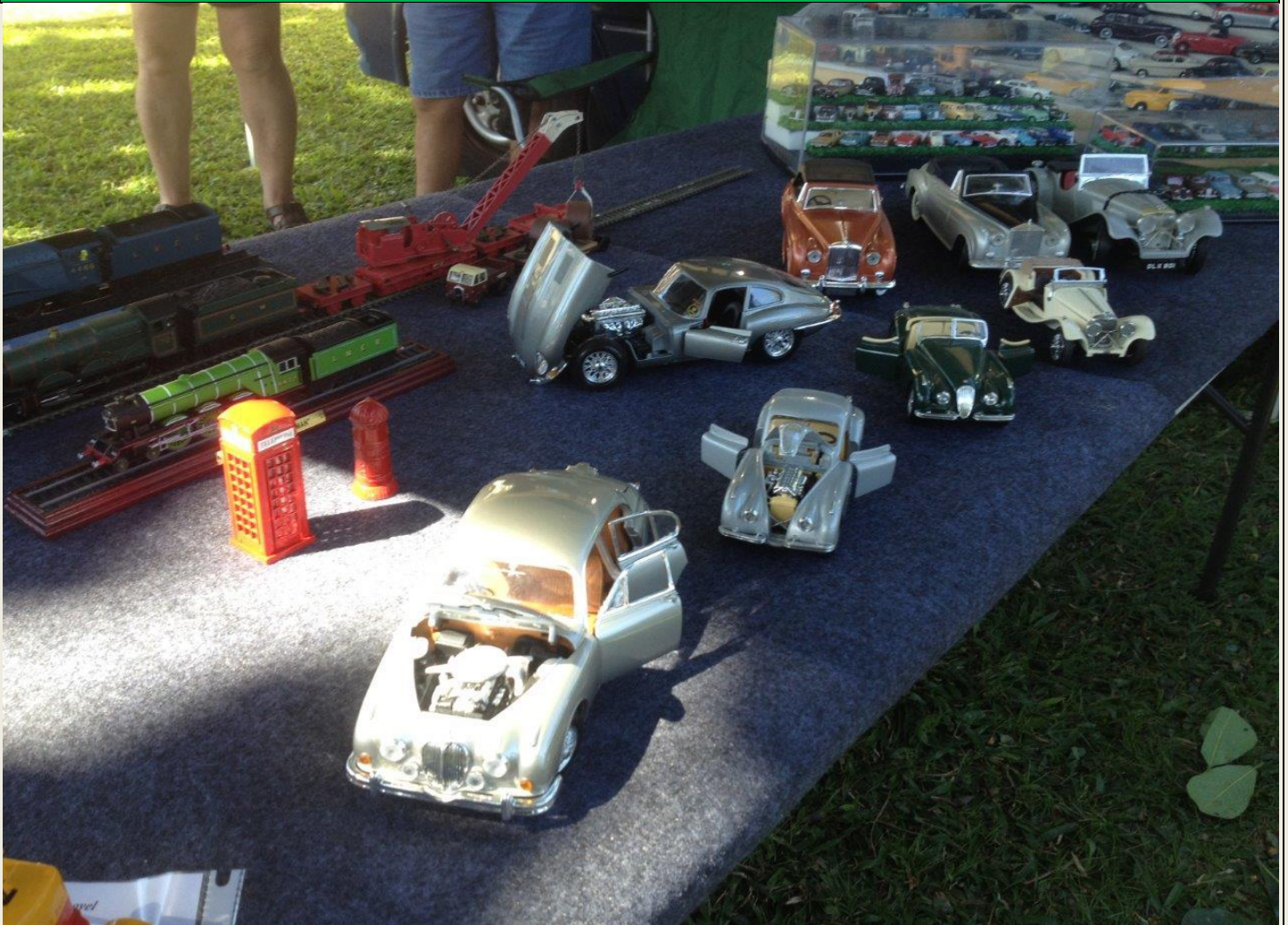
A selection of the hundreds of die-cast models on display at ALL BRITISH DAY 2016

Trophies this year were sponsored by TONY IRELAND TOWNSVILLE