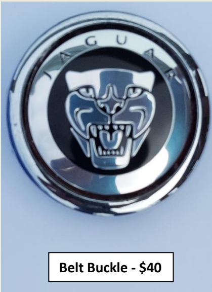
Belt Buckle - $40