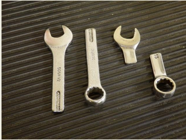
Carburettor Removal - Req'd. Cut Down Spanners