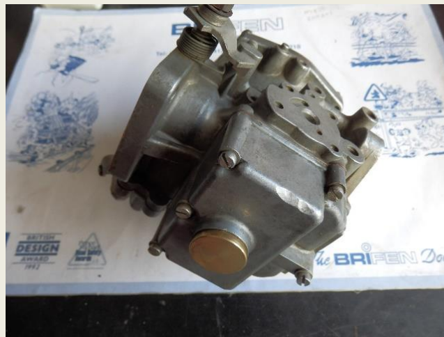
Base of Float Chamber Fretted by Steel Braided Petrol Return Pipe

During reattachment of the float chamber bottom alloy casting, it was noticed that there was a fretted area on the external edge of the float chamber, which had extended to about half the casting thickness. This had arisen from the steel braided petrol return hose over the years touching and abrading the float chamber base. This was corrected by re-angling the braided pipe, but is another area that I suggest is inspected by all V12 'E' Type drivers, as over time this could wear a hole through the float chamber base.