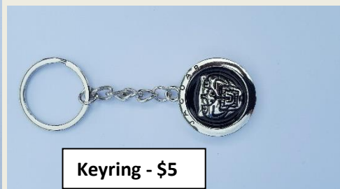
Keyring - $5