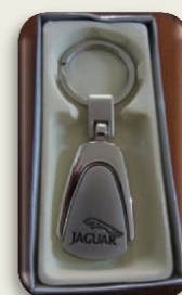
Key Ring $6