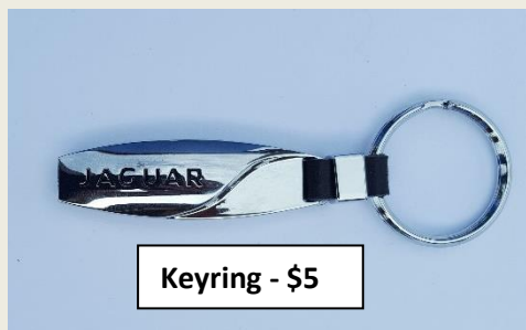
Keyring - $5