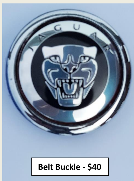
Belt Buckle - $40