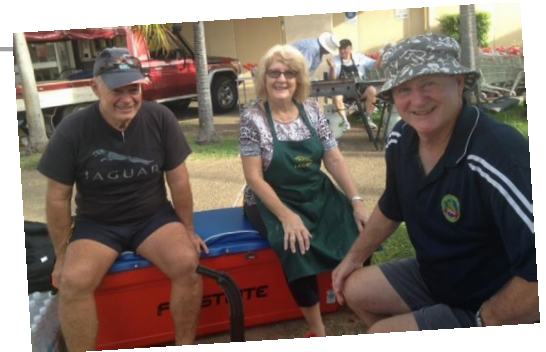
"The rose between the JAGed thorns"