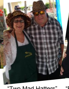
"Two Mad Hatters"