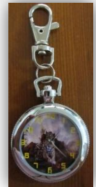
Key Ring/Watch $15

For mens belts, watches, key rings etc etc – PH: Ted Hogan H:07-4788 6342/Mob:0448 613 055 or Jim Bateman 0448 569 191