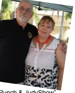
"Punch & Judy Show"