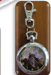
Key Ring/Watch $15

For mens belts, watches, key rings etc etc – PH: Ted Hogan H:07-4788 6342/Mob:0448 613 055 or Jim Bateman 0448 569 191