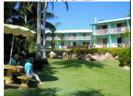
Whitsunday Sands Resort