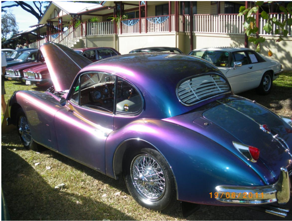
XK140-ALL BRITISH DAY