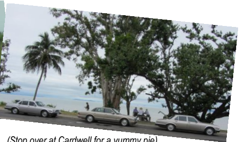
(Stop over at Cardwell for a yummy pie)

A phone call to RACQ to get the car moved to our Service Garage in Atherton. Then a phone call to Keith Metcalfe to let him know about our roadside picnic asked to speak to Jim Raw who came to collect us from the sight. With the XF Ford loaded onto the RACQ truck we proceeded to the drinks and nibbles at the Rotunda in The Big 4 Park.