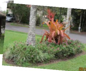
(Beautiful Gardens at Woodlands Caravan Park)