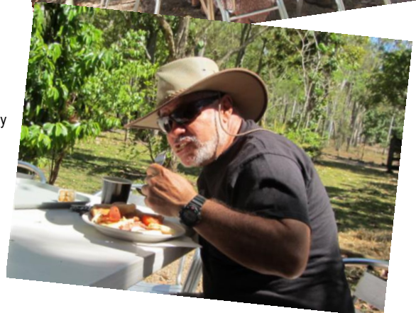
(Someone was really hungry by the time breakfast arrived)