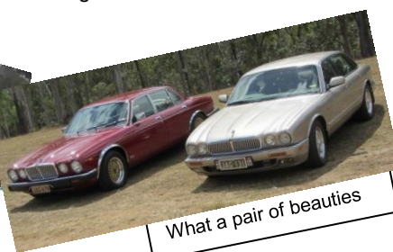
What a pair of beauties

It was a lovely setting out the back area with plenty of room and shade to enjoy the lovely morning. Some of us enjoyed a lovely walk around the bush track to wear off the big breaky while others were content to just sit and chat. It was a lovely enjoyable morning catching up with other car enthusiasts and getting the cobwebs out of the Jags.