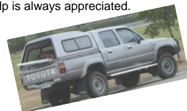
The faithful "Jagoto" was also in attendance