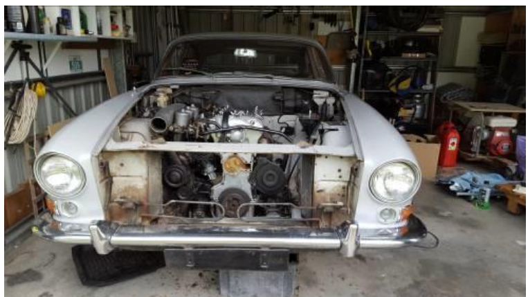
The poor young man as he is today – at least some of the dirt has been removed!