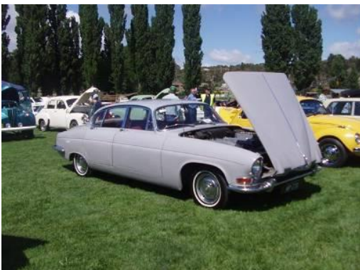
Caspian in his heyday, November 2005

This list is bound to get longer as time goes by - let's hope I can tick off these jobs and get the car registered in my time-frame - the end of this year.