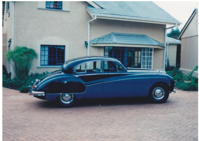
ASLAN in our driveway